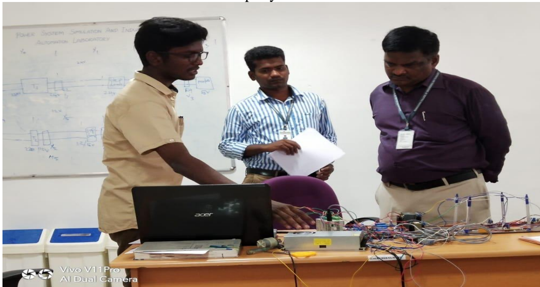
Students explain on Power Automation working field in VAC