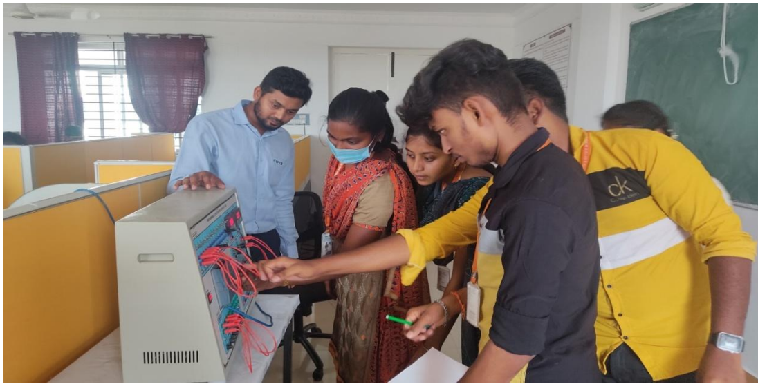
Hands on Training of Siemens S7-1200 PLC